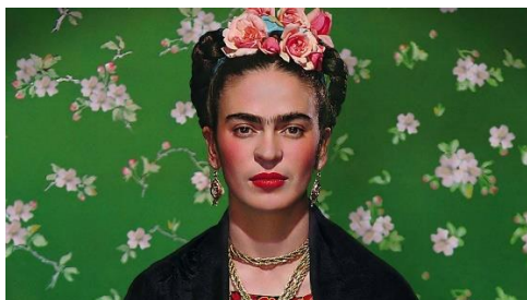
Born 6th July 1907 Dead 13th July 1954