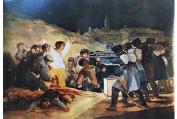
Francisco GOYA « El dos de Mayo 1808 en Madrid

Goya denounced the invasion of Spain by Napoleon's army in a painting called « El dos de mayo 1808 ». This painting shows the executions of Spanish rebels shot by French soldiers.