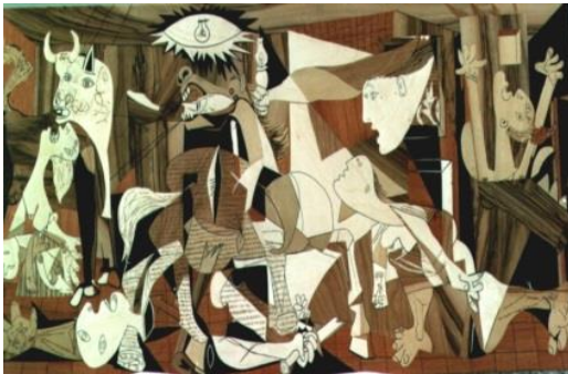
Pablo PICASSO – Guernica 1937

In his painting « Guernica » Picasso wanted to denounce the destruction of this city by the German and Italian aviation at the request of Franco, in 1937 during the Spanish civil war. The painting shows people suffering, animals and buildings destroyed by the violence of war.